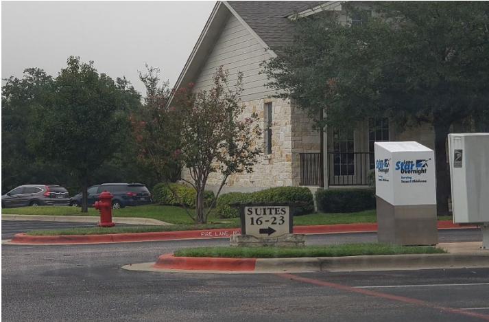
The office is directly LEFT of this sign for Suites 16-23.