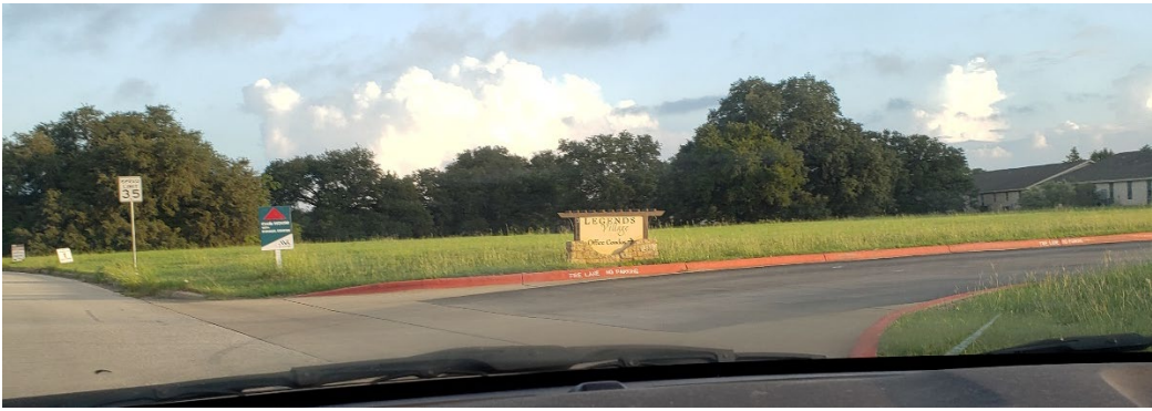
Small Sign on the RIGHT after turning onto Joe DiMaggio indicating Legends Village Office Condos entrance